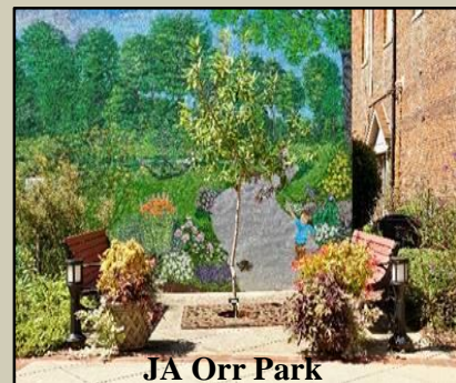
JA Orr Park